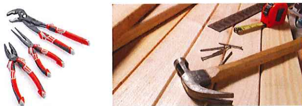
Tools, Nails & Building Materials