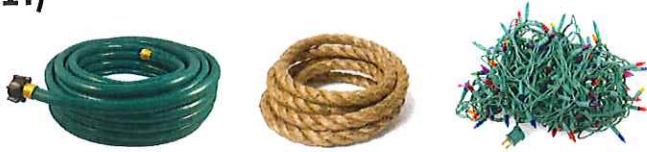
Garden Hoses, Ropes, Chains, Extension Chords, Christmas Lights