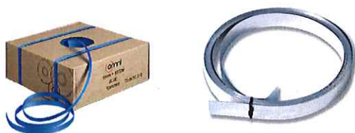
Plastic & Metal Banding/Strapping