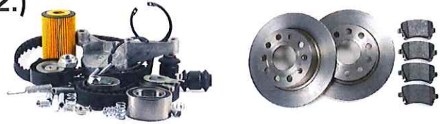
Automotive Parts: Brakes, Engine Components, etc.