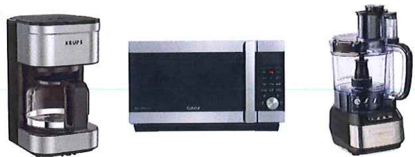
Household Electronics & Appliances