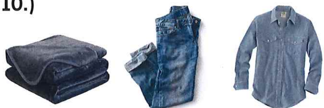
Bed Sheets, Jeans & Clothes